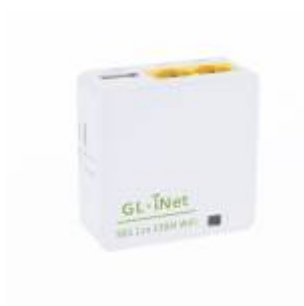
Figure 1. GL-iNet 6461 wireless router