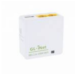
Figure 1. GL-iNet 6461 wireless router