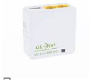
Figure 1. GL-iNet 6461 wireless router