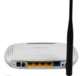
Figure 2. TP-Link WR741nd wireless router