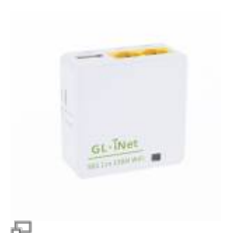
Figure 1. GL-iNet 6461 wireless router