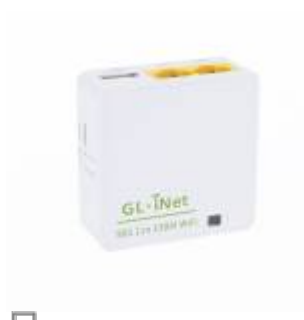
Figure 1. GL-iNet 6461 wireless router