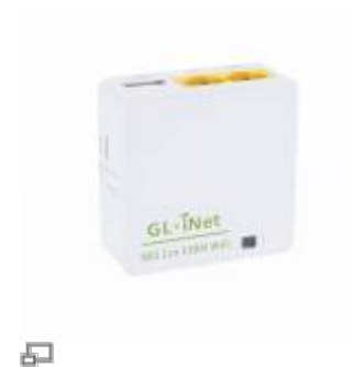
Figure 1. GL-iNet 6461 wireless router