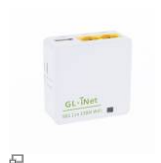
Figure 1. GL-iNet 6461 wireless router