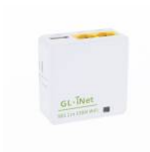
Figure 1. GL-iNet 6461 wireless router