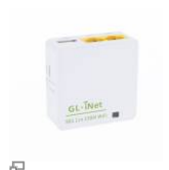
Figure 1. GL-iNet 6461 wireless router