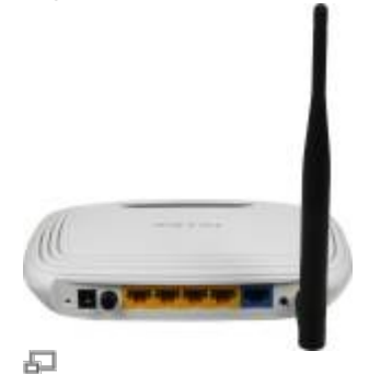
Figure 2. TP-Link WR741nd wireless router