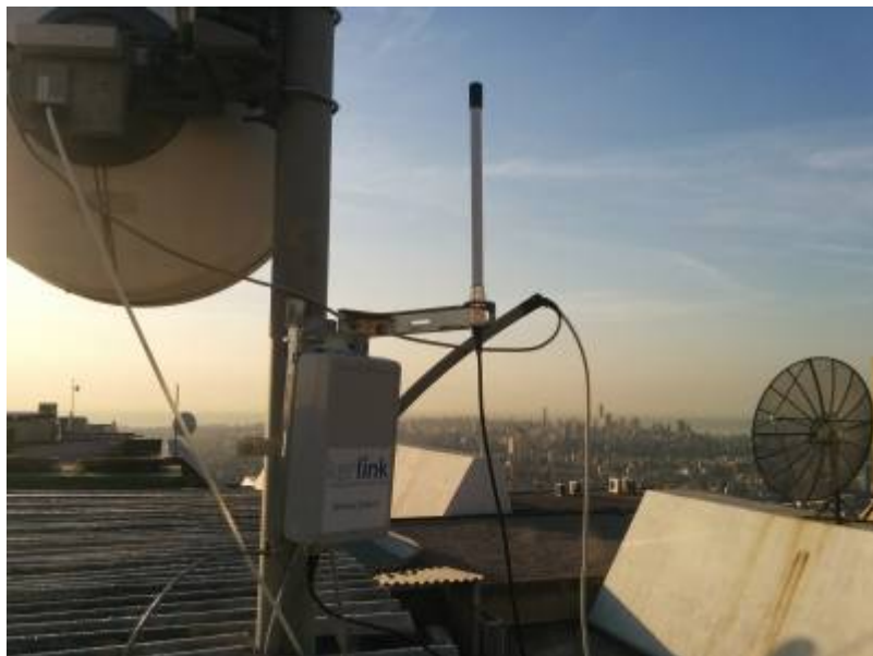
Figure 2. Outdoor antenna at ESIB-USJ