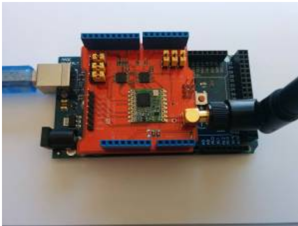
Figure 1. Arduino with LoRa Dragino shield.

Start by plugging the Dragino shields on the Arduino devices and mounting the antennas as shown in Fig. 1.