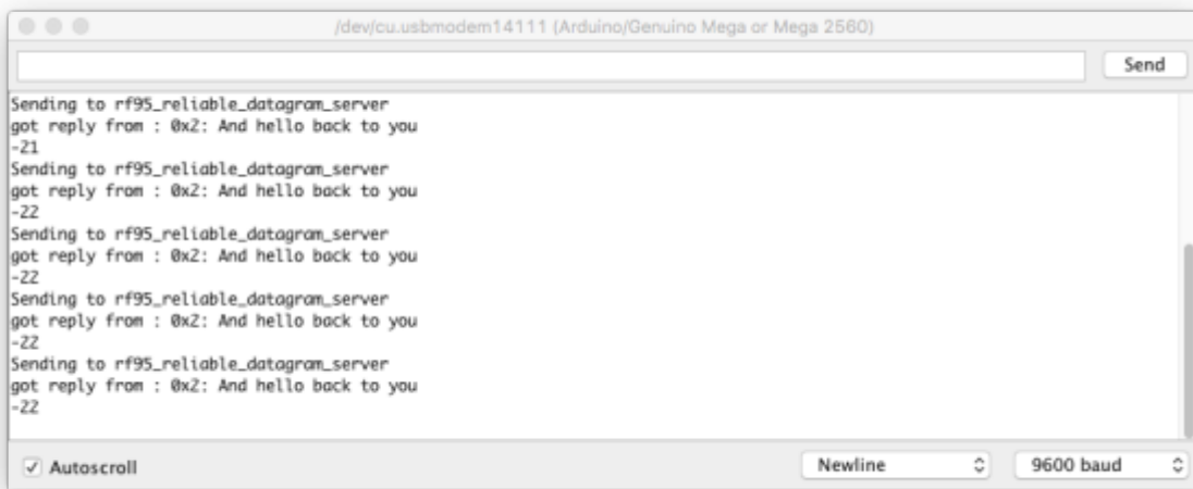
Figure 2. Client serial monitor