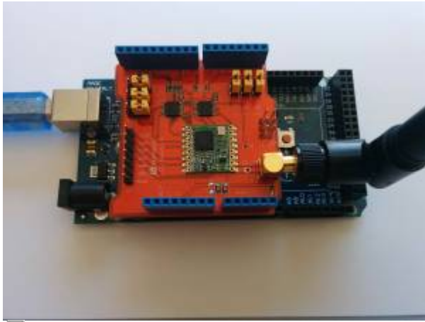
Figure 1. Arduino with LoRa Dragino shield.

Connect the two Arduino devices to USB ports on your computer. If this is the first time you use Arduino IDE, make sure to install the necessary USB drivers by selecting Tools > Boards Manager and installing Arduino AVR boards.