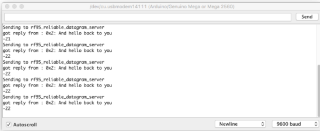
Figure 2. Client serial monitor