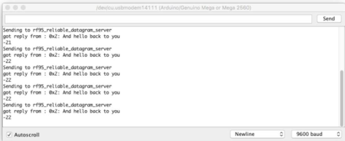
Figure 2. Client serial monitor