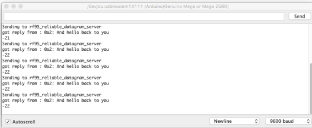
Figure 2. Client serial monitor