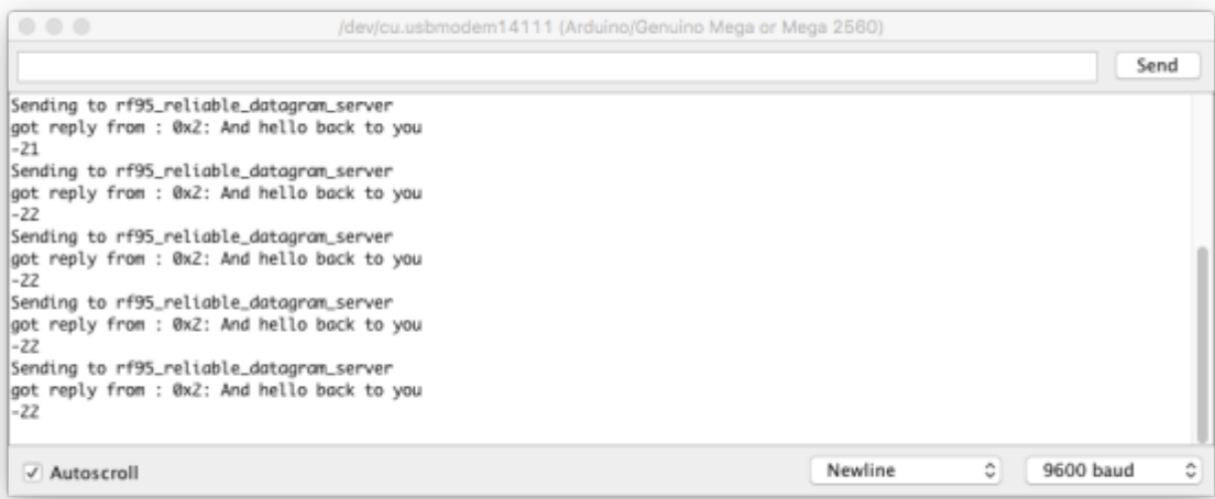
Figure 2. Client serial monitor