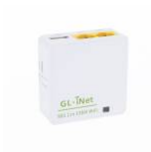
Figure 1. GL-iNet 6461 wireless router