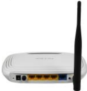
Figure 2. TP-Link WR741nd wireless router