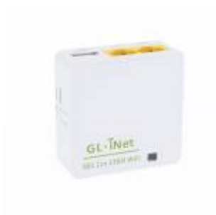
Figure 1. GL-iNet 6461 wireless router