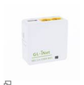
Figure 1. GL-iNet 6461 wireless router