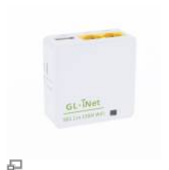
Figure 1. GL-iNet 6461 wireless router