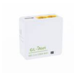
Figure 1. GL-iNet 6461 wireless router