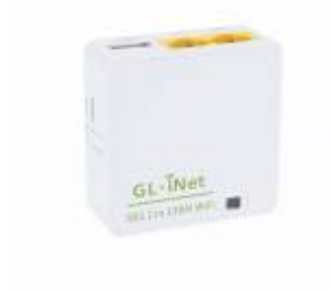
Figure 2. TP-Link WR741nd wireless router