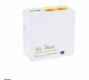
Figure 2. TP-Link WR741nd wireless router