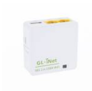
Figure 1. GL-iNet 6461 wireless router