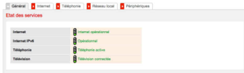
Figure 1. IPv6 activation on SFR box

SFR has now activated the IPv6 support on its ADSL boxes. Here are some snapshots of the configuration interface of a NeufBox 4 :