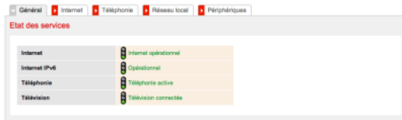
Figure 1. IPv6 activation on SFR box

SFR has now activated the IPv6 support on its ADSL boxes. Here are some snapshots of the configuration interface of a NeufBox 4 :