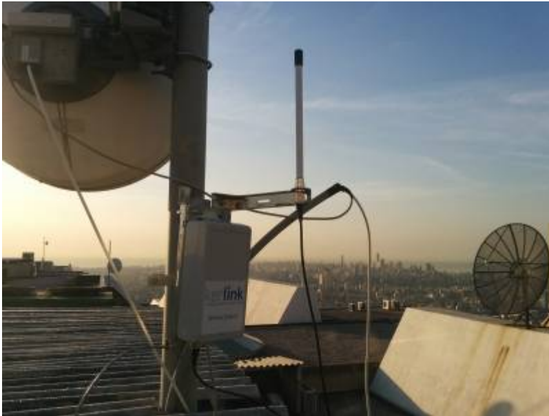
Figure 2. Outdoor antenna at ESIB-USJ