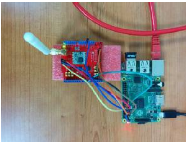
Figure 2. LoRa single channel gateway

The single channel gateway includes a LoRa transmission module (Dragino Shield) connected to a Raspberry Pi (2 or 3) as shown in Figure 1. Communication between the two modules is done over an SPI interface.