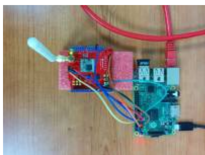
Figure 2. LoRa single channel gateway

The single channel gateway includes a LoRa transmission module (Dragino Shield) connected to a Raspberry Pi (2 or 3) as shown in Figure 1. Communication between the two modules is done over an SPI interface.